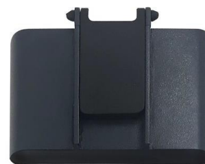
SP-600 Wireless pH/ORP Module